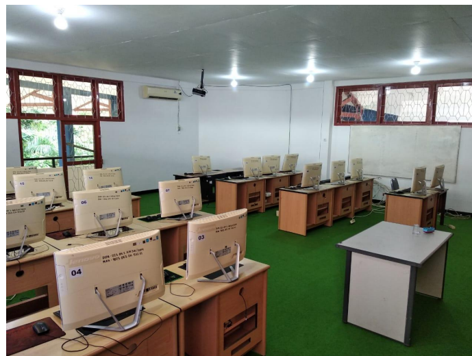
Computation 2 Laboratory