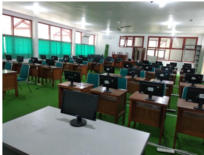
Computation 1 Laboratory

The facilities provided by the laboratory are a high specification of computers in various brands, software, and super computer for data processing. Laboratory services focus on supporting Tri Dharma activities, including teaching, conducting research, and performing community service. This support involves the software for data processing, such as R, python, et all.